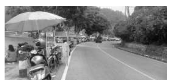
Fig. 1 Street Vendors on the roadside of Singaraja-Denpasar route

domination of non-Hindu Balinese over Balinese Hindus. On the other hand, the presence of street vendors at the Ulun Danu Beratan Temple is very difficult to regulate.