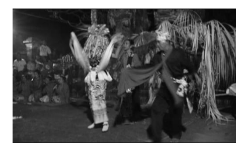
Figure 3. Seblang dance ritual by the Osing people of the village of Olehsari, Banyuwangi region, East Java for 4th Pasamuan Seni & Ketuhanan/Sharing Art & Religiosity at the Mandala Wisata Samuan Tiga in Bedulu, Bali, 26 March 2004.

realm for prosperity, healing illness, and well-being.