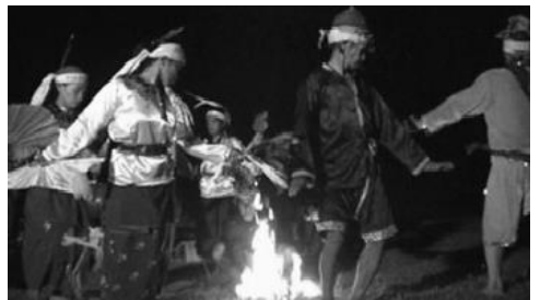
Figure 4. Balia customary ceremony by the Kaili people from the Donggala district of Central Sulawesi for 4th Pasamuan Seni & Ketuhanan/ Sharing Art & Religiosity at the Mandala Wisata Samuan Tiga in Bedulu, Bali, 26 March 2004.

What emerged from sharing art and religiosity inspired by Samuan Tiga was a participatory space generated from traditional and modern art offerings by people of diverse cultures and faiths and a common field for intercultural and interreligious creativity. In 2004, this