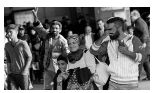
Fig. 3: Joy and relief at the arrival in Munich

Those hopes and dreams that protections seekers wish to find in Germany, oftentimes collide with the ultimately discovered reality. The term "culture of welcome" originated in 2015 with the arrival of 20.000 protection seekers in Munich who have been welcomed by the German population with applause, hugs and gifts. This action showed solidarity and the positive attitude towards protection seekers whose joy and relief can be seen in figure 3 (Große 2019: Deutschland und die Flüchtlinge).