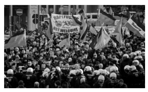
Fig. 4: Demonstrations in Chemnitz by Aljazeera (2018)

Protection seekers are oftentimes generalized as "Muslim", "violent criminal" and "foreigner". Those Eurocentric labels show that little knowledge of the circumstances that persuade someone to leave his or her country and take the risk of a dangerous journey to Europe exist. They also show the little knowledge about Islam in many parts of the German society.