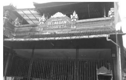
Image 2. The Bale banjar , public hall in traditional Bali communities.

The idea of state refers to the understanding of the Balinese ruling class or Balinese noblemen as ones who have had their central power in the Balinese palaces from the traditional to the modern times. In the context of the society or Balinese community, it is significant to see the Balinese community regarding their own adat regulations and the rights of the local people. It is argued that the civil society has a crucial role in accordance with the role of the traditional organizations like the Balinese banjar or hamlet that exists in every village. It is well known