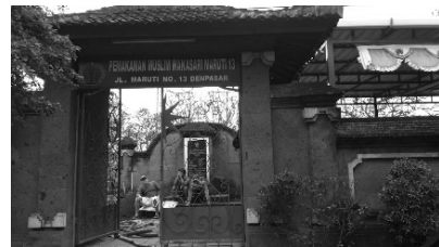
Image 4. The gate of Muslim grave yard at Wanasari Denpasar

The construction of a multicultural society cannot be separated from its long history. The impacts of the Dutch colonial policy were the attraction of the Vreemde Oosterlingen or Orang Timur Asing such as the Arabs, the Indians and the Chinese to Denpasar. In addition to this, the classification of the Balinese society based on the aristocratic class, the middenstand and the common people influenced the complexity of the problems in Denpasar. The historical processes and migration have strongly affected the emergence of certain